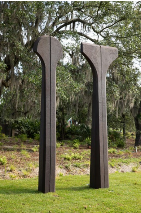
Split Ritual II , 1996 Sydney and Walda Besthoff Sculpture Garden New Orleans Museum of Art, New Orleans, LA

In 2020, the US Consulate in Milan acquired Longo Monolith (2008) for their new building designed by SHoP Architects, to be installed upon completion of construction.