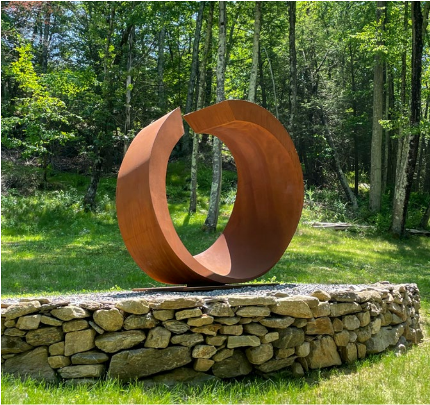
My Circle , 2008-2023