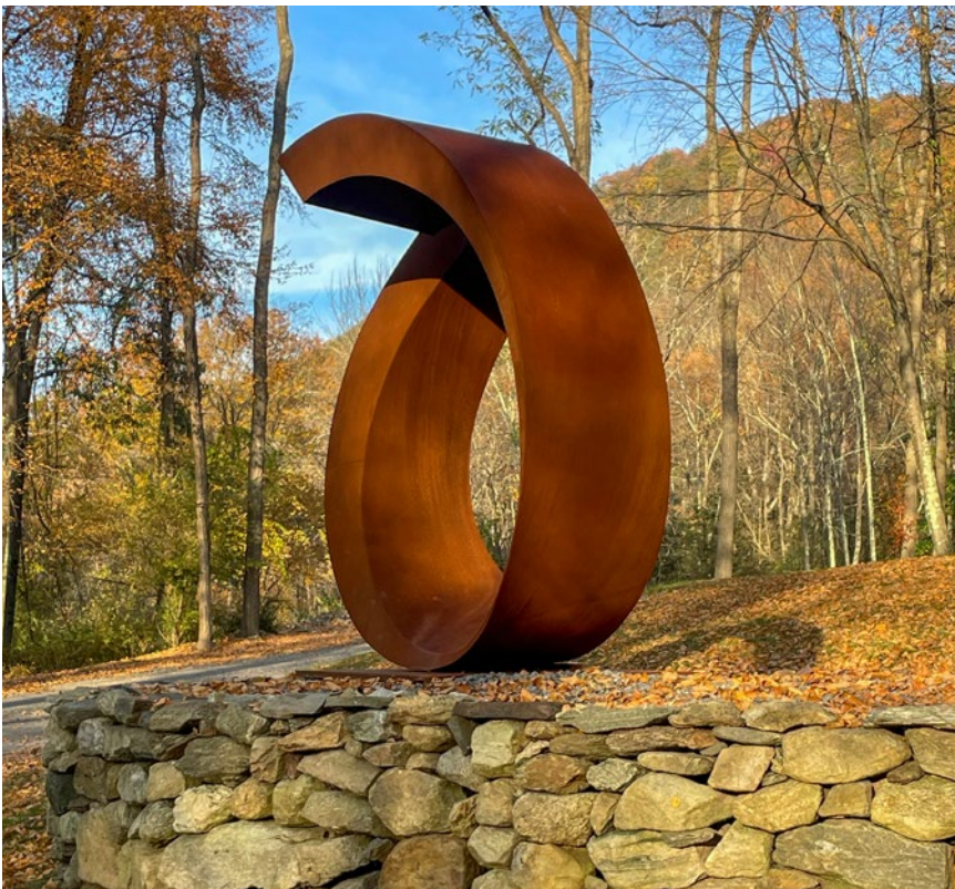
My Circle , 2008-2023