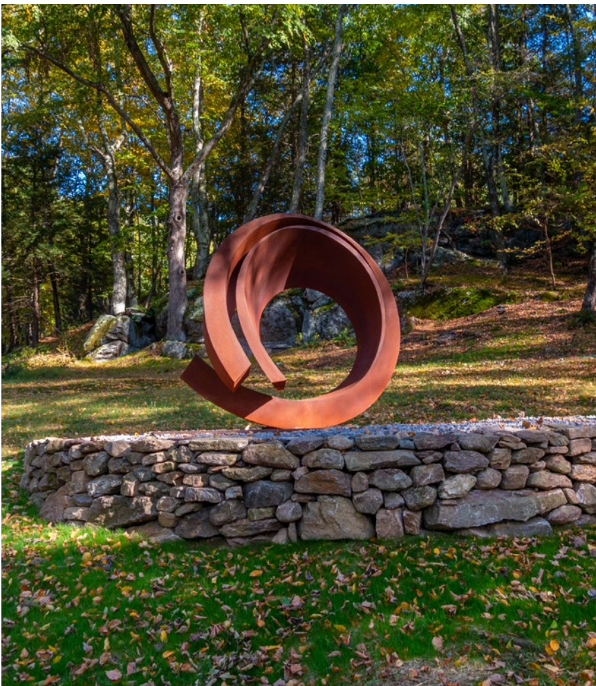
Clodia Medea , 2014-2018 Private collection, United States