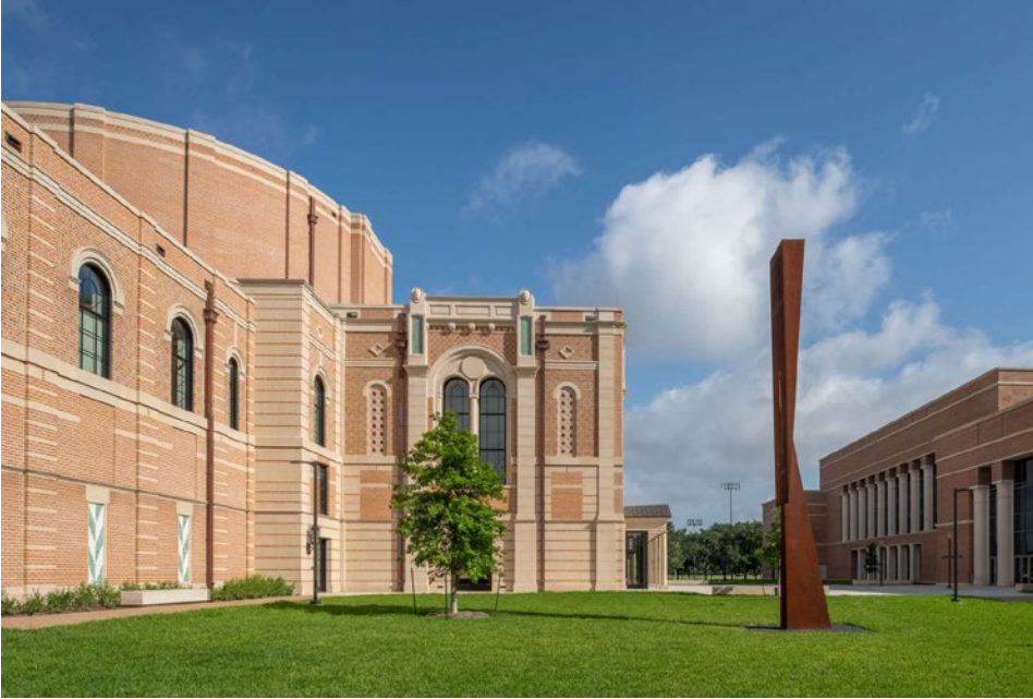
Occam's Wedge , 2008-2021 Rice University, Houston, Texas