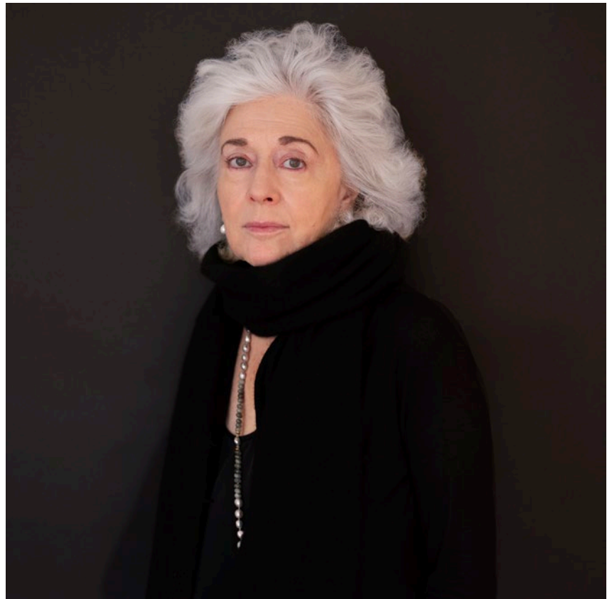
Jorie Graham, / “Late Work How the poet Jorie Graham — living with cancer, reeling from her mother’s death — wrote the best book of her long career.”

Jorie Graham Executor, Beverly Pepper Estate