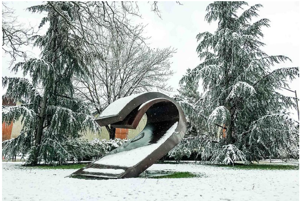
Double Sbalzo , 2012 Pratt Institute, Brooklyn, NY

The Cassino Museum of Contemporary Art in Cassino, Italy opened in 2013 to house Sergio and Maria Longo's extensive collection. Sergio Longo's company Iron produces Cor-Ten / Indaten steel, one of Pepper's signature mediums. The sculpture garden at the Cassino Museum of Contemporary Art features multiple monumental Pepper Cor-Ten works, including: Octavia , 2014; Curved Presence , 2012; Helena , 2014; Nuova Twist , 2010; and Longo Monolith , 2007.