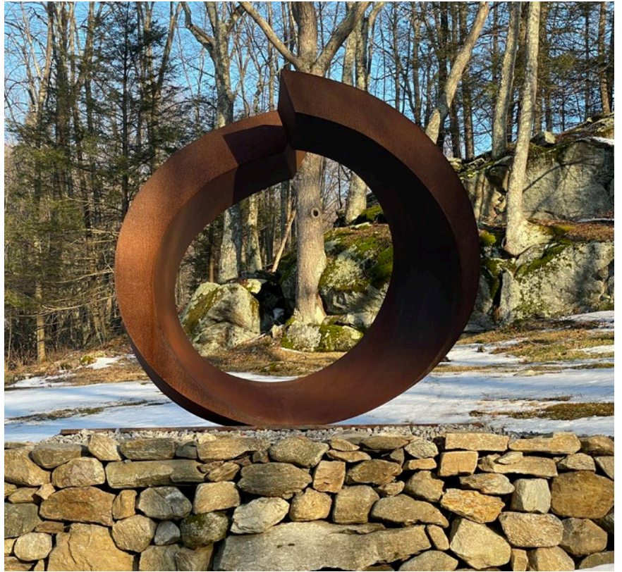
My Circle, 2008-2018