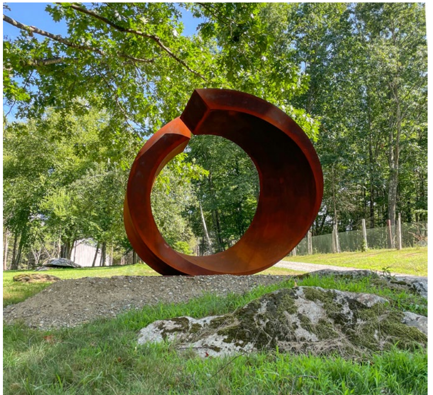
My Circle, 2008-2022